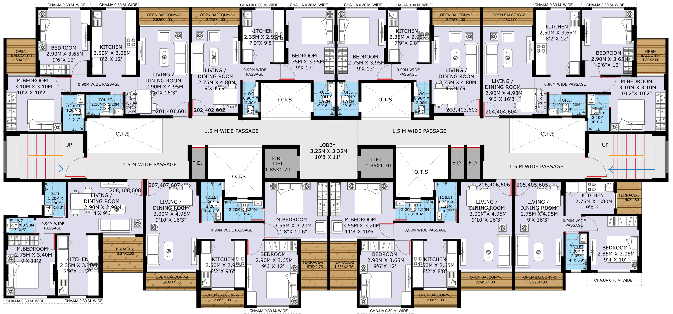
TYPICAL 2ND, 4TH & 6TH FLOOR PLAN ( BUILDING - A2 ) SCALE-1 : 100