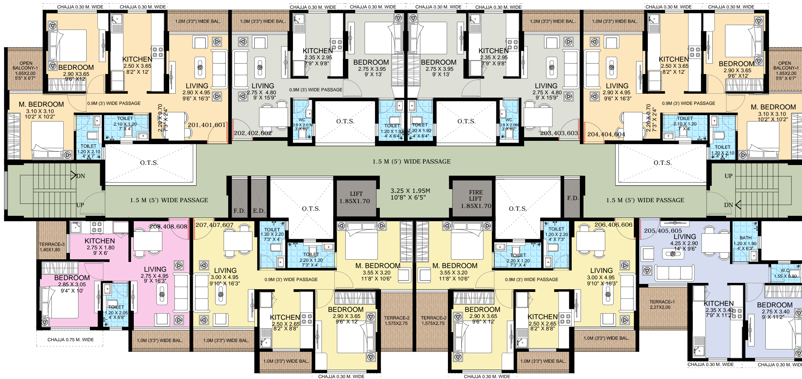
TYPICAL 2ND, 4TH & 6TH FLOOR PLAN ( BUILDING - A1 ) SCALE-1 : 100