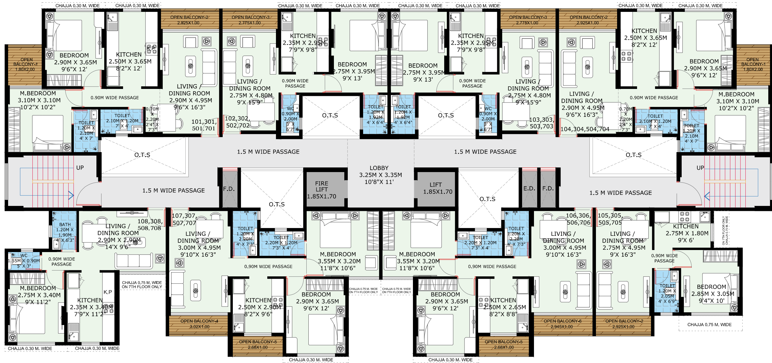
TYPICAL 1ST, 3RD, 5TH & 7TH FLOOR PLAN ( BUILDING - A2 ) SCALE-1 : 100