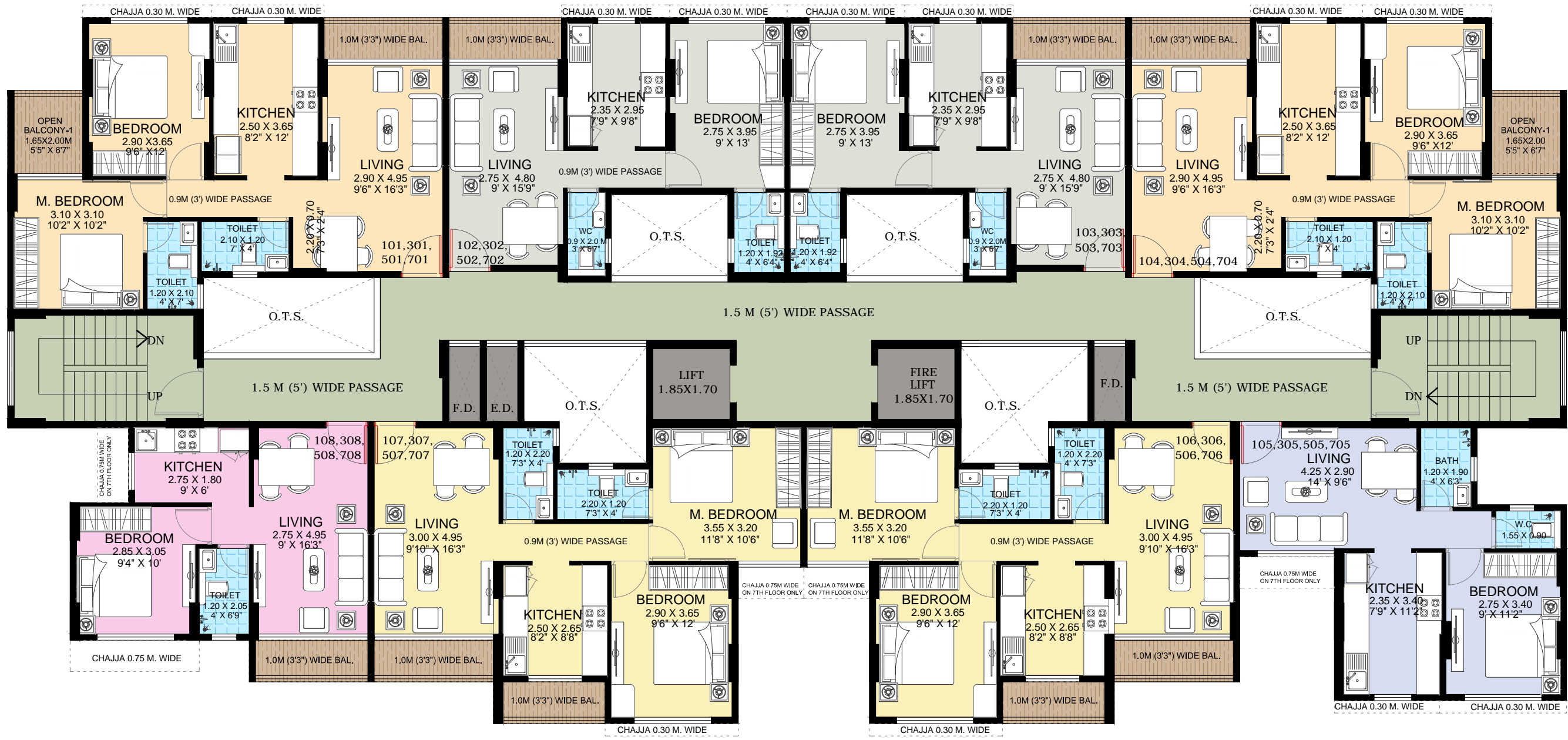
TYPICAL 1ST, 3RD, 5TH & 7TH FLOOR PLAN ( BUILDING - A1 ) SCALE-1 : 100